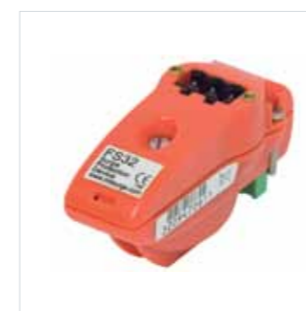
FS32 Pluggable trunk surge protector